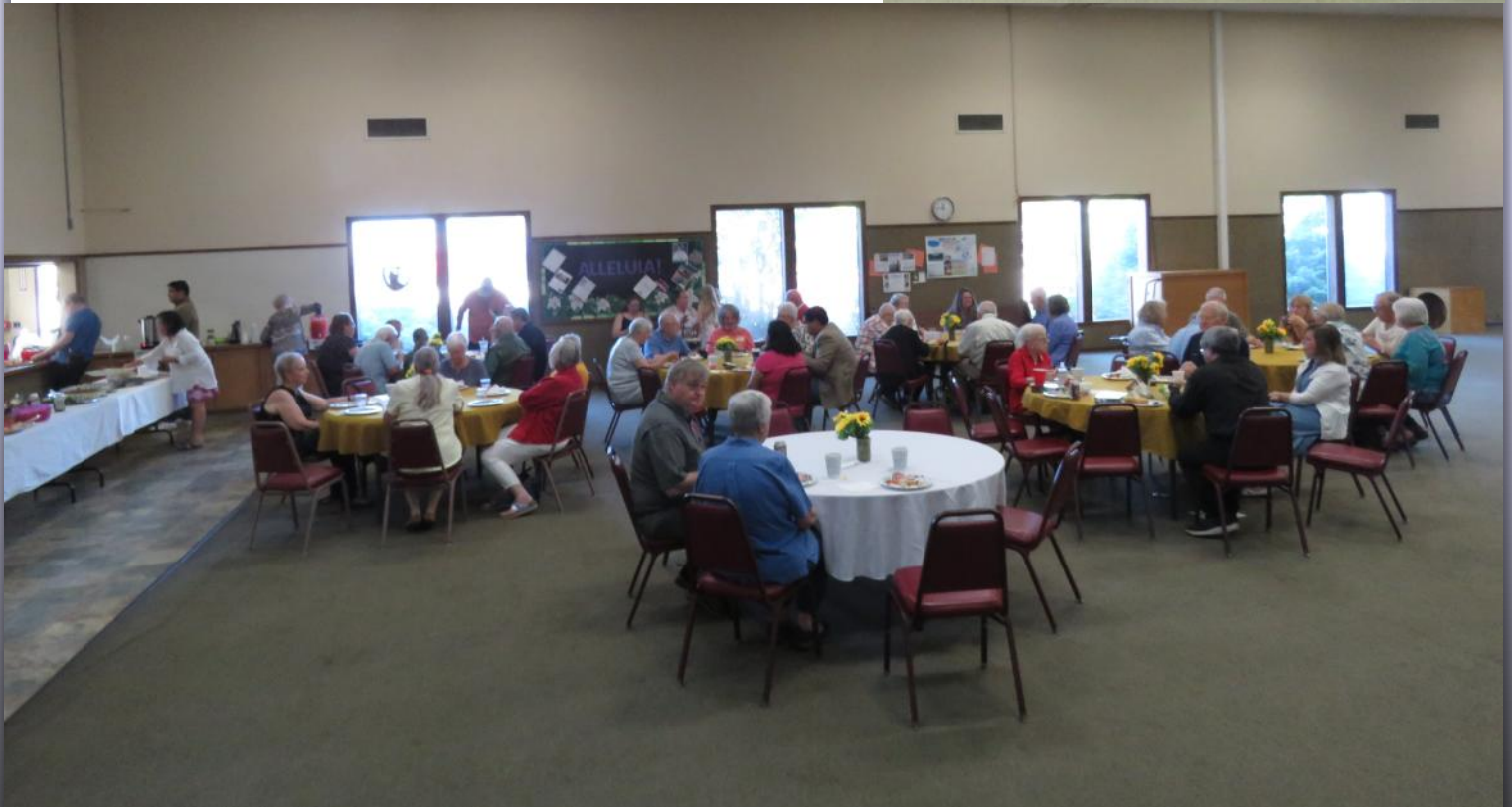
Another wonderful potluck lunch after worship put together by the Care Team & Fellowship Team.