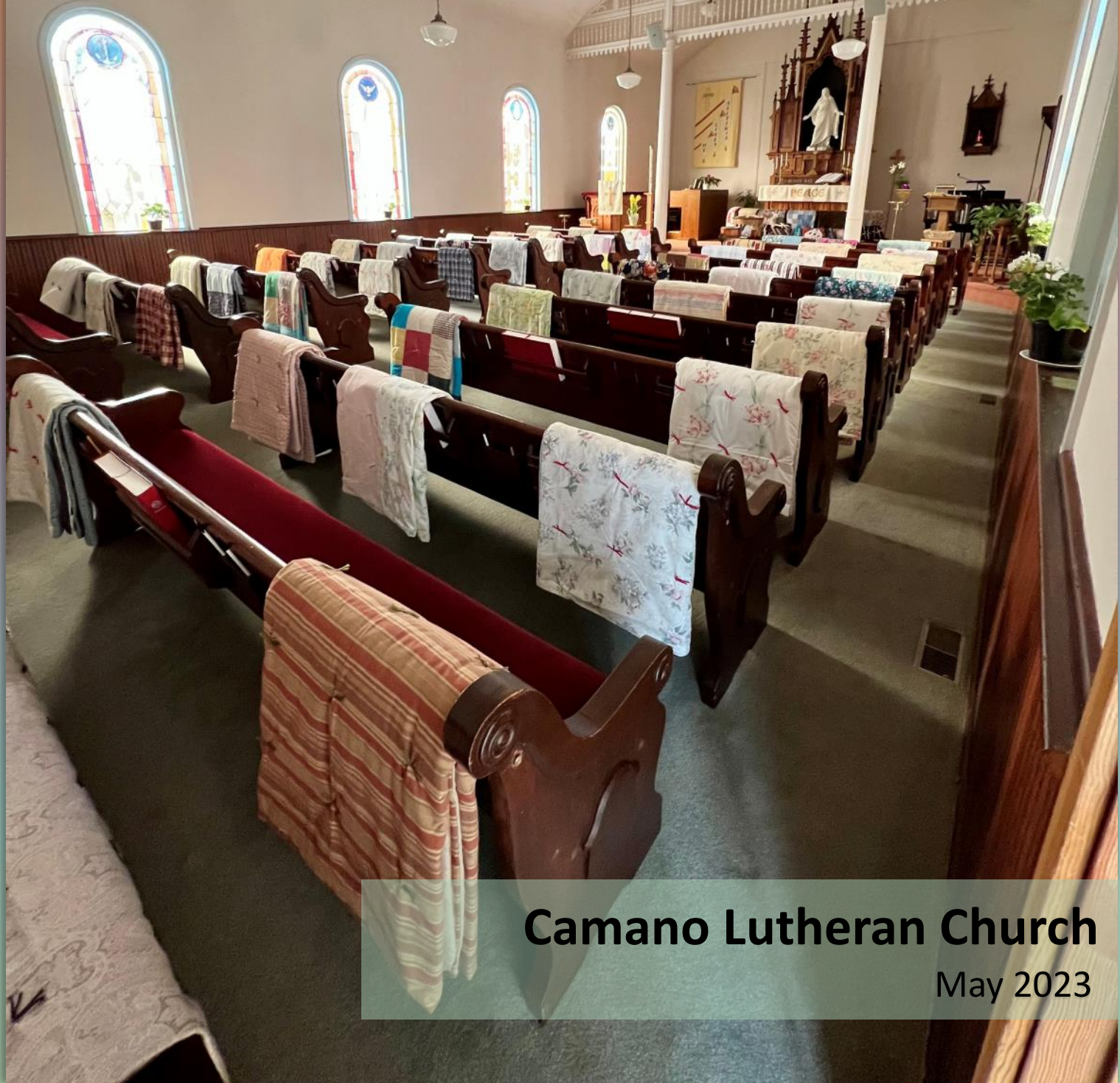
Camano Lutheran Church May 2023